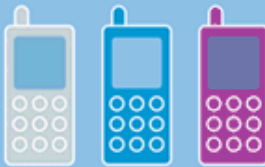
Nickel Cadmium Lithium